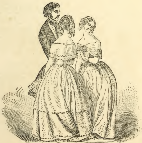
THE MAZURKA STEP.

N. B. For those not acquainted with the foreign terms for dancing, a few lessons will be required to make them understood.